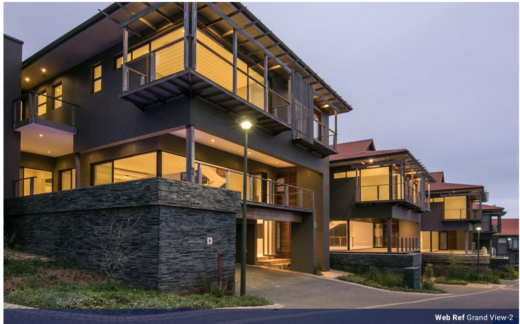
Web Ref Grand View-2

Seeff Zimbali & North Coast Sales Centre Nexus House, Office A Zimbali Northgate Suites Zimbali Estate, 4422