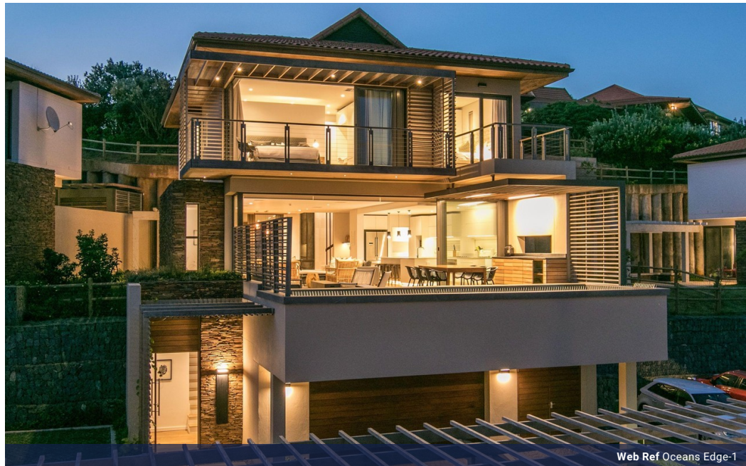
Web Ref Oceans Edge-1

Seeff Zimbali & North Coast Sales Centre Nexus House, Office A Zimbali Northgate Suites Zimbali Estate, 4422